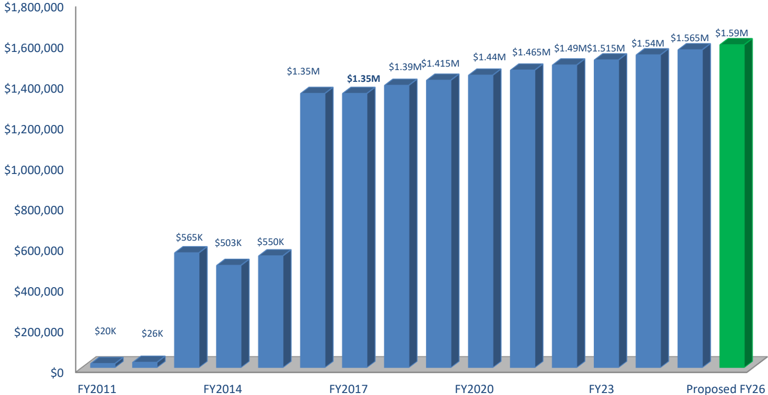
Annual Funding - OPEB Liability

↑ Change in health care plan ↑ Change in health care plan