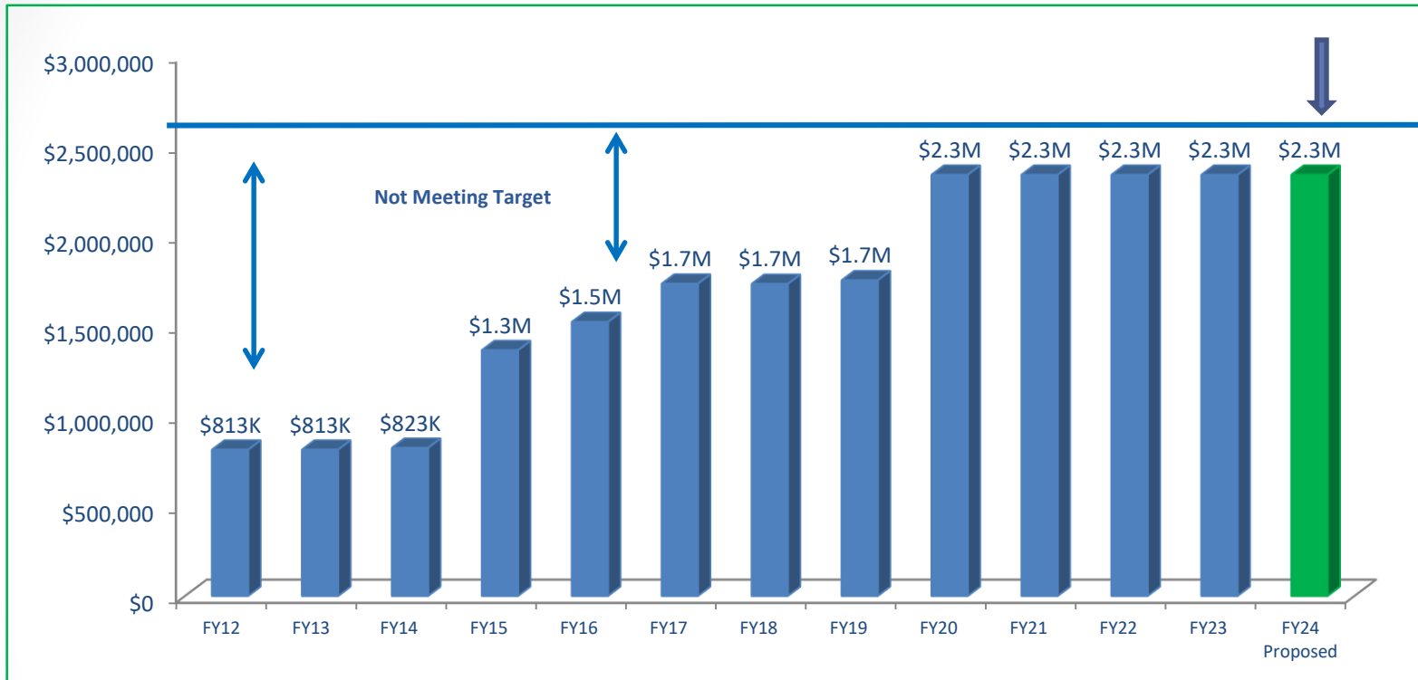
Base Capital for School and Municipal

Target Per Financial Policies Approx. $2.6M