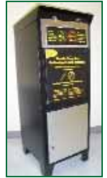
Sharps Collection Kiosk

In order to dispose of sharps in the sharps collection kiosks, you must use a red, one-liter sharps disposal container. These disposal containers are now available free of charge at the Westwood Health Department, 50 Carby Street, on Monday, Wednesday and Thursday from 10:00 a.m.-12:00 p.m. and Tuesday evenings from 3-6 p.m. The containers will also be available at the Westwood Town Hall, 580 High Street, and the Senior Center, 60 Nahatan Street during regular business hours.