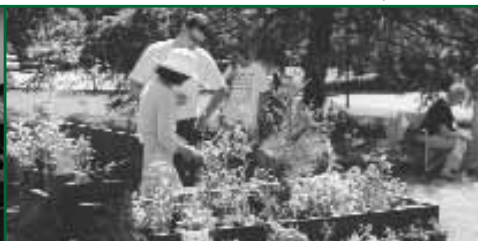
Plant Sale at the Historical Society