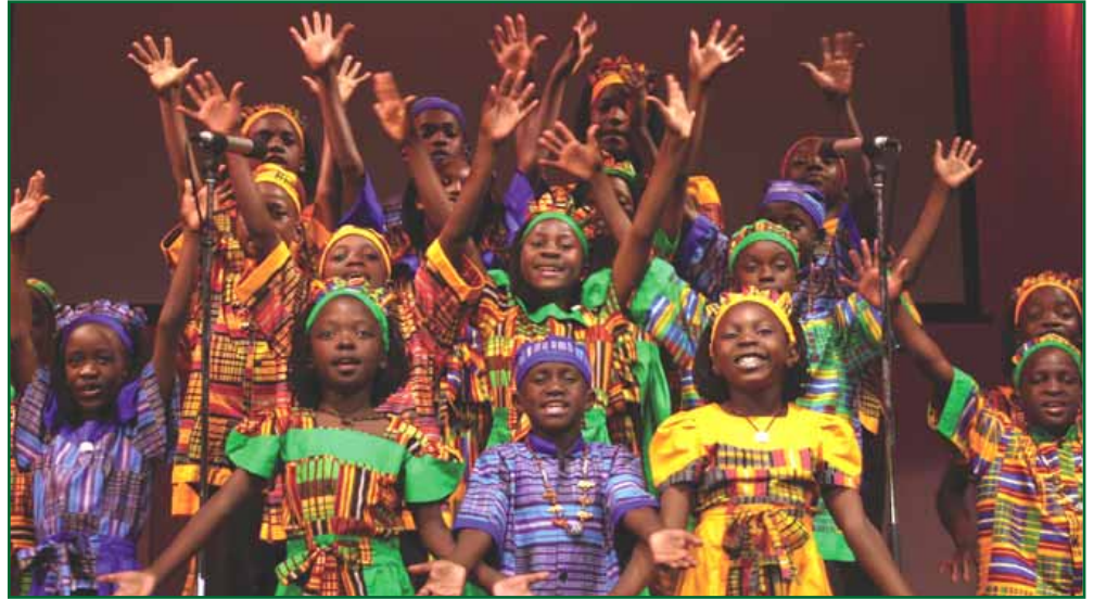
The exhilarating performance of the Watoto Children's Choir from Uganda was part of a series of offerings promoting and celebrating diversity.