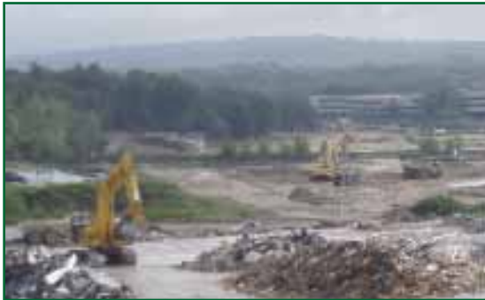
View from Nstar building parking lot to "T" station parking garage (top right) on August 8, 2008.

For weekly construction updates and photos on the web, go to: http://www.wscommunityonline.com/Pages/updates/ConstructionUpdates.html ❖