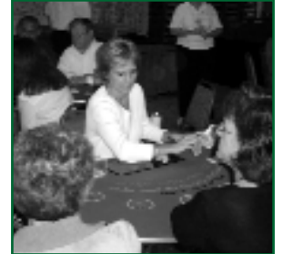
Last year's Casino Night was a huge success. Mark your calendar for this year!

Those who attended the Westwood schools and would like to register with the alumni, or learn more about the Association may do so at www.westwoodhighalumni.org . ❖