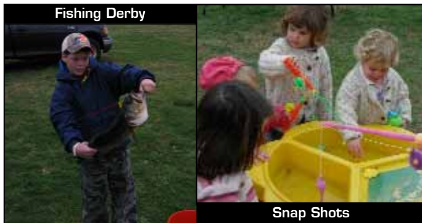
The Westwood Recreation Department and the North Walpole Fish and Game sponsored a very diverse Fishing Derby last May. This annual event draws anglers of all ages.