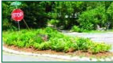
Spectra Energy/Algonquin Gas is the sponsor of this beautiful island.

Buonato Granite & Marble, Coldwell Banker, Cooperative Bank, Dedham Institution for Savings, Donlon Draper Inc., Einstein's Landscaping, First Parish Church, Garden Tech Horticultural Services, Guidon Landscape, Hale Reservation, High Rock Garden Club, Ian Brown Landscaping, New England Golf, R&A Pisano, Sovereign Bank, Spectra Energy/Algonquin Gas, Westwood Historical Society, Westwood Rotary, and the Westwood Young Women's Club.