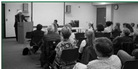
Lecture at the Library