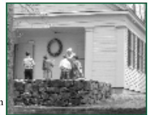
Are you a Westwood alumni? Come browse memorabilia from various Westwood schools on September 7th and October 5th.

The Westwood Historical Society is a non-profit organization and exists to preserve Westwood's unique history. It supports the study of history by conducting school programs and by educating the community through public programs and exhibitions. Everyone is always welcome. ❖